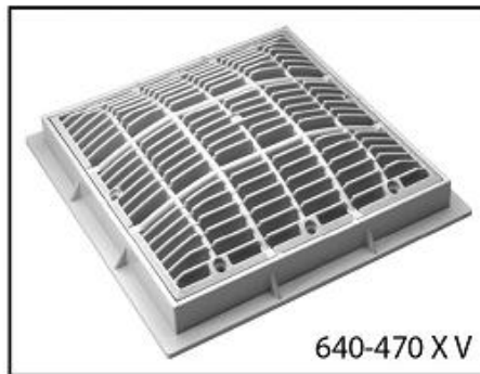
640-470 X V